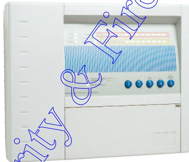
FXRP2200BW repeater panel